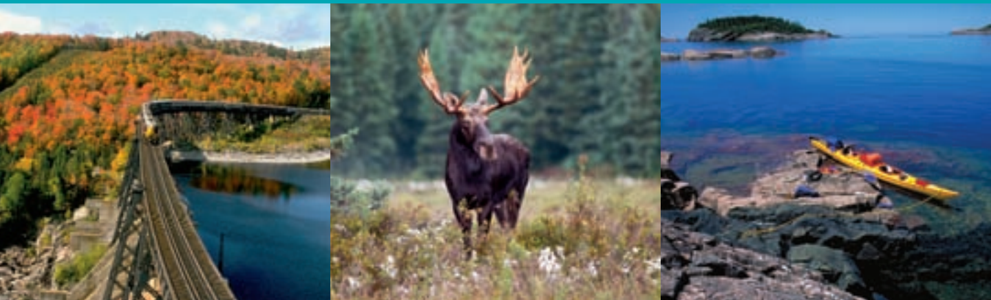
L – R: Agawa Canyon; Northern Ontario; Lake Superior Provincial Park

Toronto • Sault Ste. Marie • Lake Superior Provincial Park • Hearst • Chapleau Crown Game Preserve White River • Pukaskwa National Park • Rosspoint • Thunder Bay • Kenora • Stratton